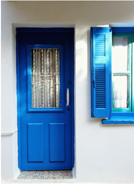
Opening doors in Centre County!

To make dreams come true, contribute to the American Dream Housing Fund.